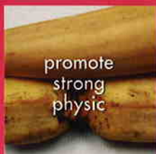
promote strong physic