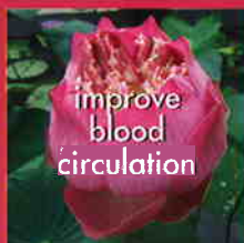
improve blood circulation