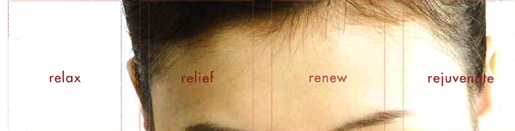
Only well-formulated products can coax your complexion into reaching a level of perfection