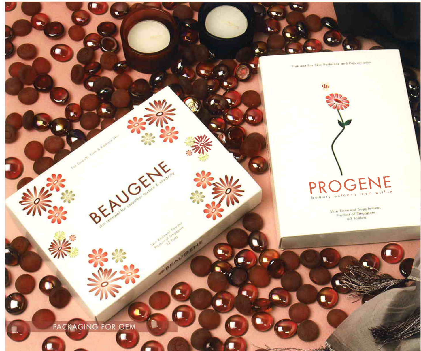
PACKAGING FOR OEM